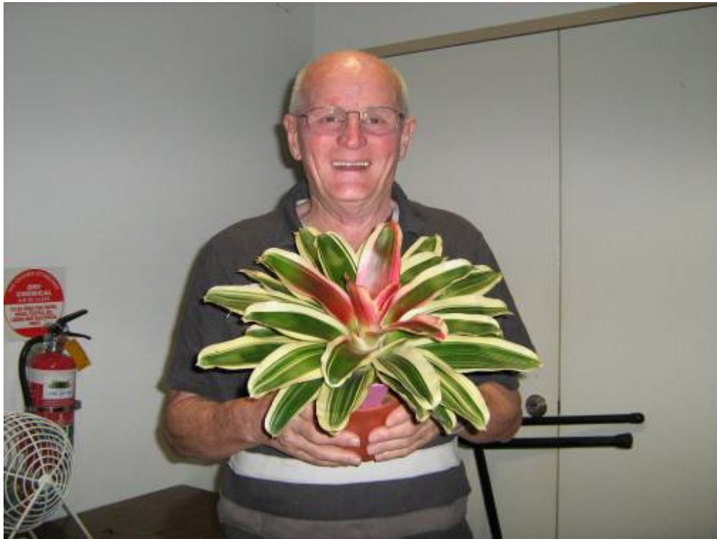
Unknown Neo.David Vine