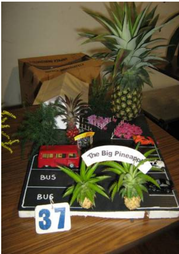
The Big Pineapple Wolf Mountain

OR send email to : gardennut@live.com.au