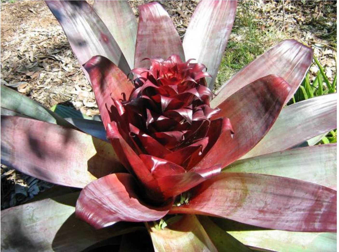
Alcantarea Skotak Photographed at Pam Butler's Open Day